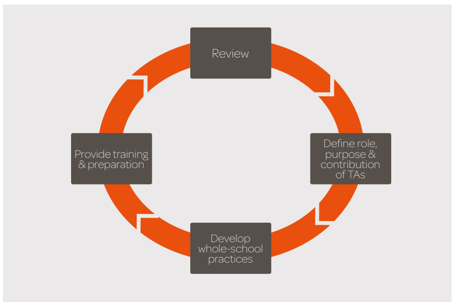
Figure 3. A process of school improvement regarding the use of teaching assistants

Figure 3 shows a model for school improvement that SLTs have previously found useful in reviewing the current use of TAs and guiding a process of change. This should shape an action plan for your school, which can then act as a foundation for training and deploying staff. Importantly, training should include supporting teachers in how to work effectively with TAs.